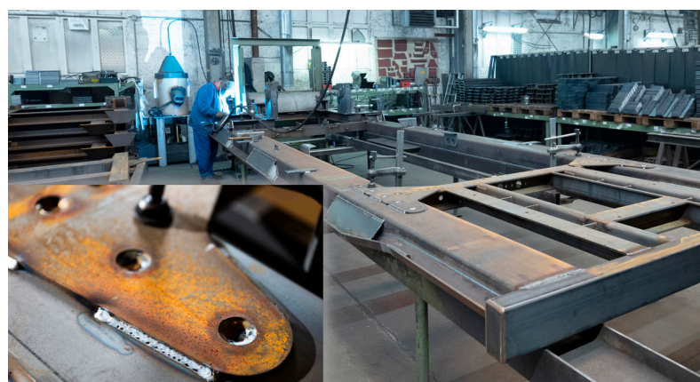
The innovative forceArc puls welding process is used in every area of steel construction for welding untreated black steel. Process reliability is high, and the virtually spatter-free seam is perfect.