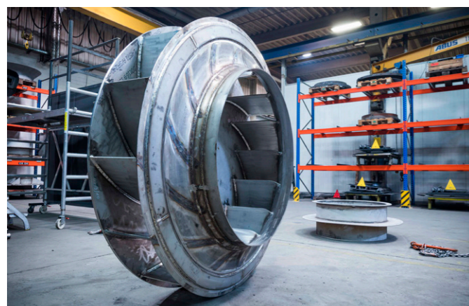
A welded fan wheel with a diameter of 3.5 metres. Including the reinforcement rings there are over 60 metres of weld seams in the component here.

of a power source, wire feeder, and welding torch is part of the system concept. In addition the highly diverse welding procedures can be matched to the specific application, the welding consumables, and the software. Here particular attention is paid to the networking and implementation of data transfer between welding machines and the production process planning in relation to the smart factory as part of Industry 4.0.