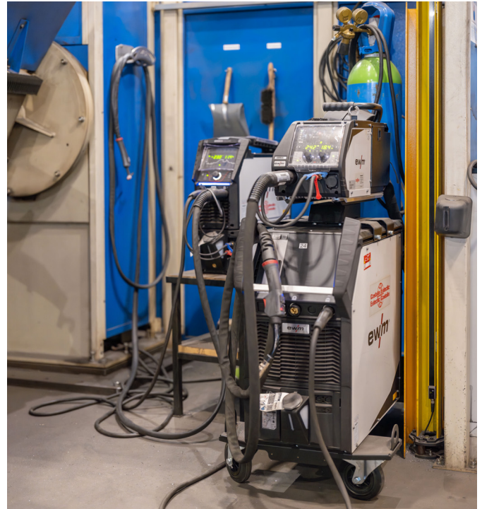
With its modern inverter technology and integration of all welding processes, the Titan XQ 400 (right) offers optimal conditions for precise and efficient welding.

It impresses with its precise control and the ability to customise welding parameters. A robust click wheel allows the welding machine to be operated even when wearing welding gloves. This ensures safe and comfortable handling even under demanding conditions. Both device series are connected to the Welding 4.0 welding management system ewm Xnet. This digital system allows welding data to be recorded centrally and evaluated in real time. This ensures complete documentation and quality assurance. Continuous monitoring of all processes provides a comprehensive database for optimising workflows.