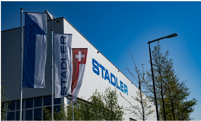
Stadler Winterthur AG manufactures bogies for standard and broad gauge trains – including SMILE, FLIRT and KISS – as well as for trams.

As an international company, Stadler Rail is represented in 25 countries with 16 production and component plants, five engineering sites and more than 80 service locations. In addition, its solutions are in use in 48 countries worldwide. The workforce consists of employees from over 75 different nations. Stadler Winterthur AG is the centre of excellence for bogies. At its site in Oberwinterthur, bogies for standard and broad gauge trains – including SMILE, FLIRT and KISS – as well as for trams are manufactured on over 20,000 m 2 of production and storage space. As the successor to Schweizerische Lokomotiv- und Maschinenfabrik (SLM), Stadler Winterthur AG has over 150 years of rail vehicle expertise. Since 2010, the main site has been located on Sulzer-Allee. With the opening of a new logistics and assembly building in spring 2022, Stadler Winterthur AG has further established itself as a centre of excellence and now employs around 400 people.