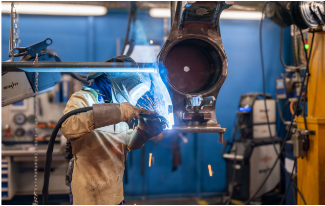
The MAG welding process is predominantly used for the manufacture of bogies.