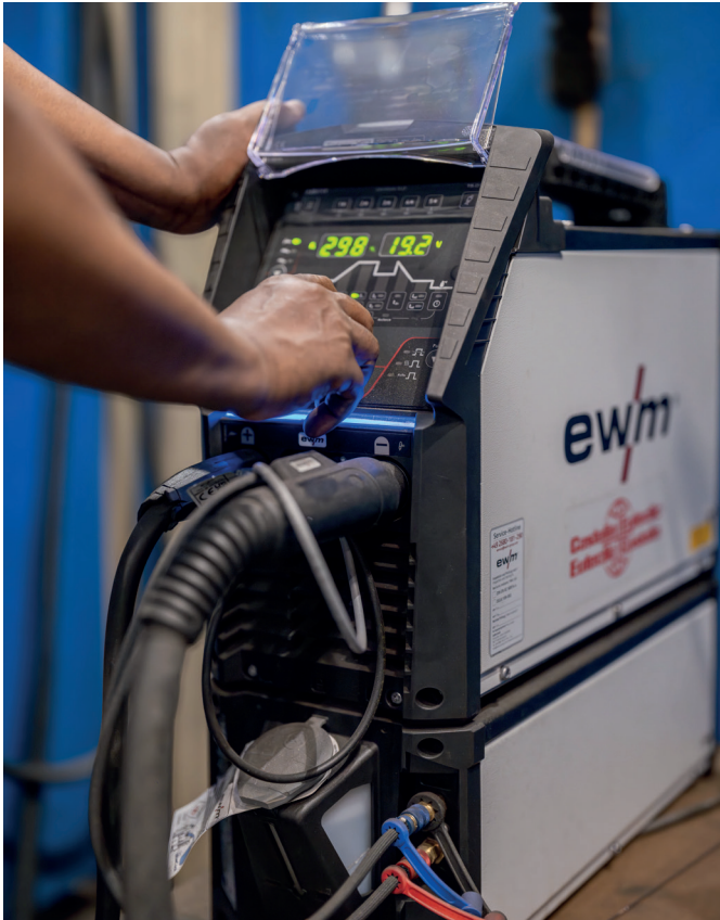
The Tetrix XQ 300 impresses with its sophisticated control system and customizable welding parameters.